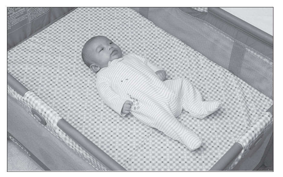
approved for safe sleep as they can cause suffocation or create a fall risk. If you are unsure about a product, please review safety information that is provided with the

product or contact your pediatrician or community safe sleep specialist.