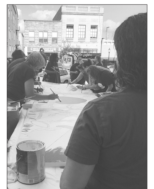
Community members painting a mural to encourage acceptance and reduction of stigma regarding substance use and mental health issues